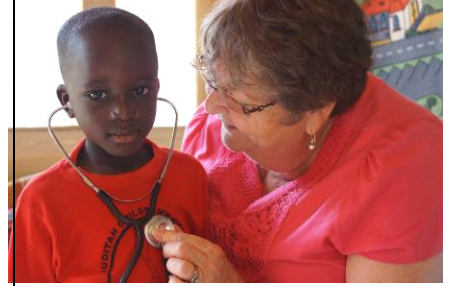
Above: Hearing his heartbeat for the first time