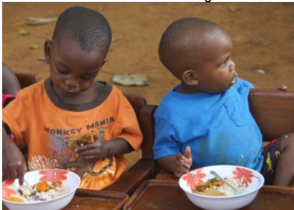
Above: Party food includes Samosas.