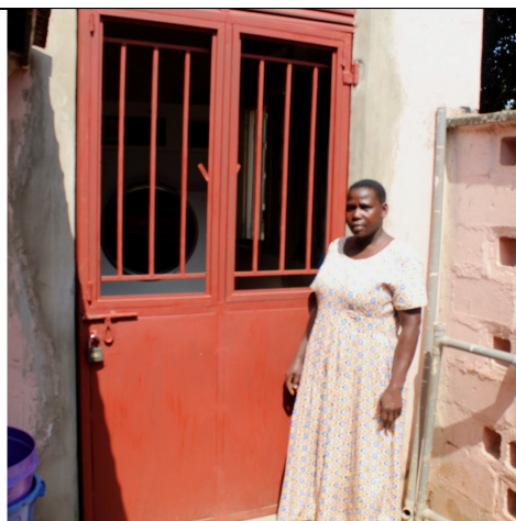
The new extra wide Laundry Room door.