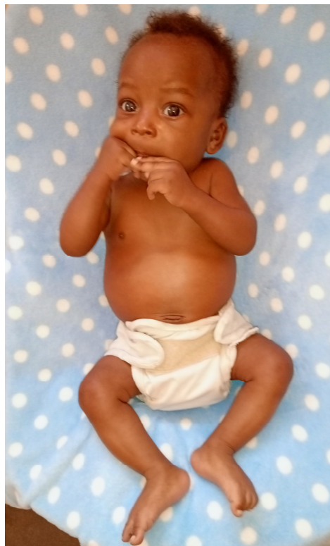
This boys mum died of Cancer soon after birth.