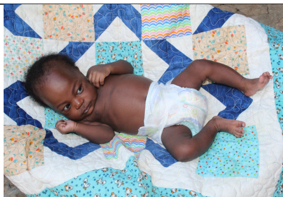
This girls mother died in childbirth.