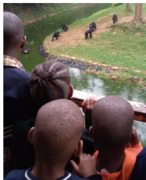
A visit in person is a lot of fun for our kids.