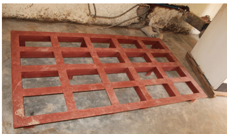
New Laundry floor with metal pallet for washers.