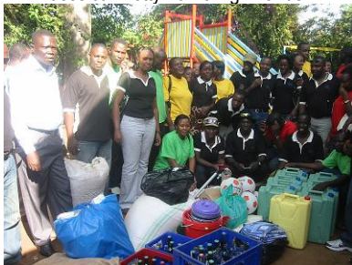
Face Group Technology gifts. Thank You!!