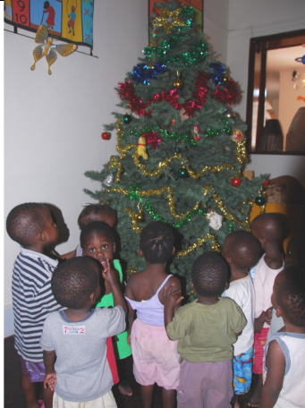
The exciting time of Christmas