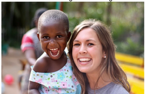
Their cups overflow with the joy of loving!