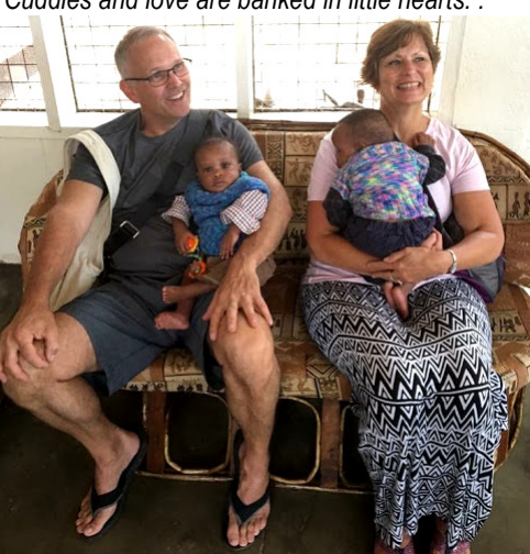
There is always a need for tender loving care.