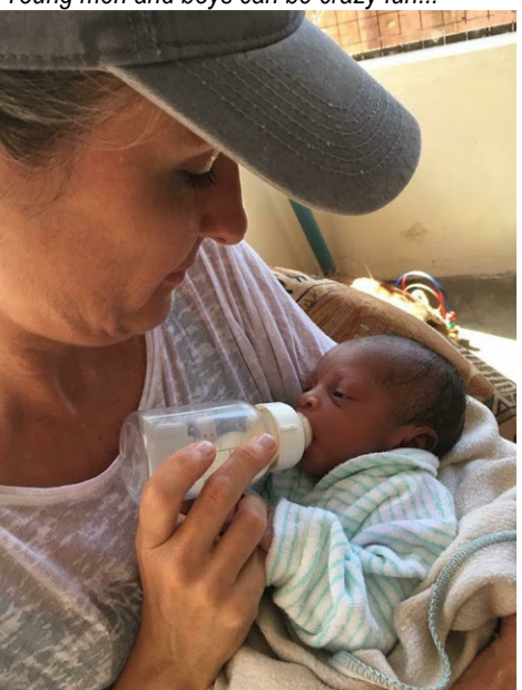
One of our tiniest - being loved & fed good formula