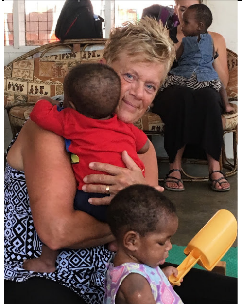
Cuddles and love are banked in little hearts. .