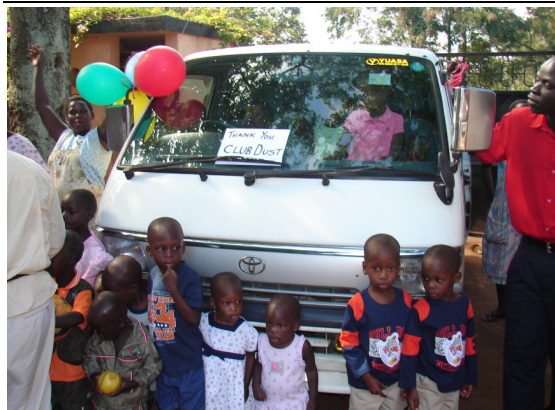
Our New (to us) Van -14 cozy seats, 4wd Diesel Thank You CLUB DUST !!!

"To Love, Care, and Pray Destitute Babies Back to Health; or into Jesus Loving Arms."