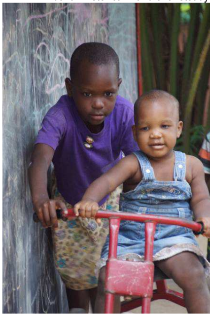
Above: Teaching a little one to ride a bike.