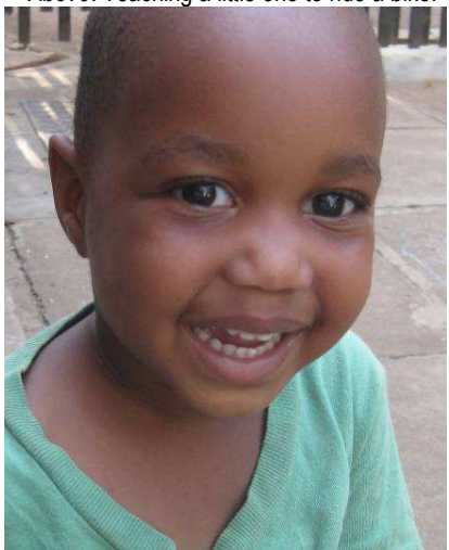
Above: A tender happy heart, very loving.