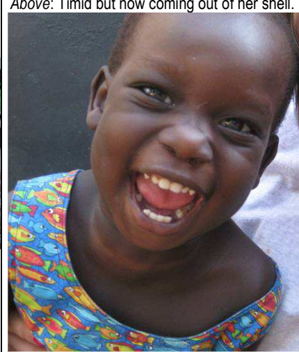
Above: A sweet little miss, always full of life

NEW (bold), MOVED(Underlined) Twins not Shown]