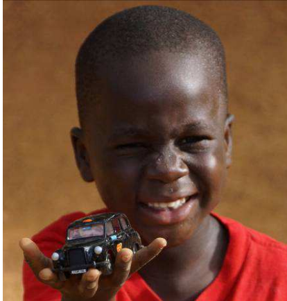
Above: Mister calm and ever steady.