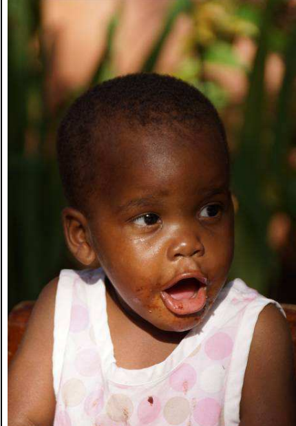
Above: Timid but now coming out of her shell.

For many of our workers at Welcome Home they have the same testimony as the children. Love has lifted them from the tough lives that many have come from. They have found love and support and encouragement to be able to make something of their lives. Many have taken advantage of our interest free micro-financing to help get their families to a better financial footing. It is good to see them prosper making a difference for their family.