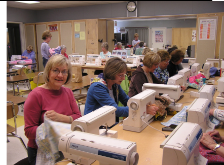
Sewing Day at St. John's Episcopal