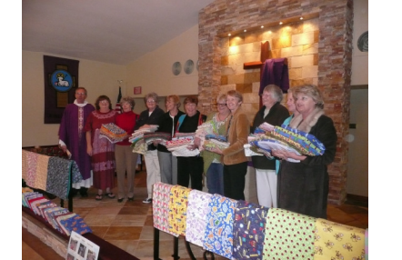
Quilt Dedication at Church