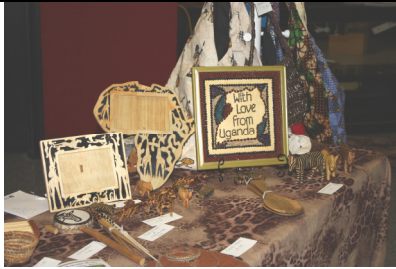
Items from Uganda for sale