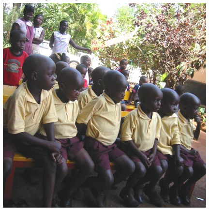
Our Iganga cousins