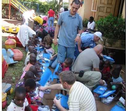
Christmas shoe boxes