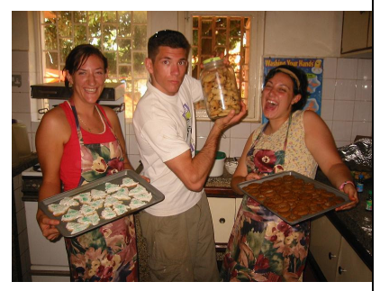
Volunteers baking cookies