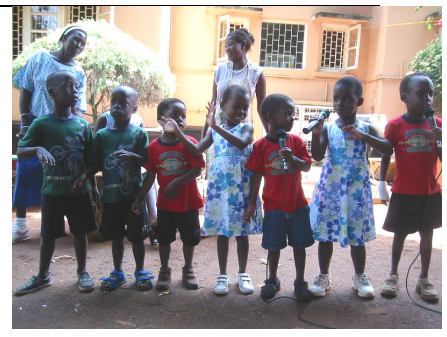
Our young music leaders