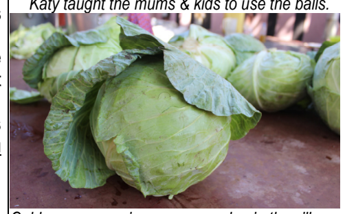
Cabbages grown in our own garden in the village.

Blessings from Mandy, and Your Welcome Home Family.