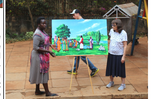
We were gifted a wonderful flannel graph set.

This past month has been a quiet one at the home after the very busy time in July. The children and the staff are all doing well. They are surviving all the red dust that coats everything because of all the road-work. They are very slowly building a good foundation for the road after digging it down by at least 4 feet and are building it up again properly. They are also putting in large pipes for drainage. It has been a challenge getting in and out of our entrance to the home.