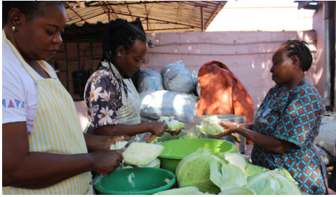
Mums help the cooks. Shredding cabbages

We are eating vegetables out of our own village gardens. This helps our budget as Ugandan food cost has skyrocketed this past 2 years ( Ukraine war ).